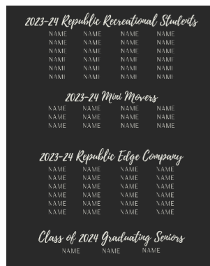
(Recital Shirt Back)