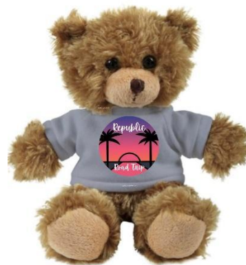
(Recital Teddy Bear)