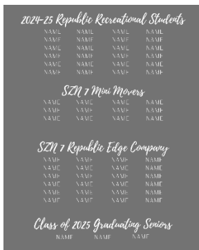
(Recital Shirt Front)